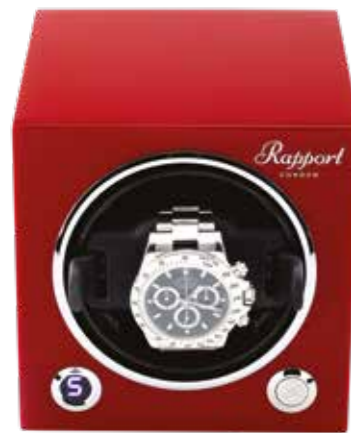
EVO43 Crimson Red