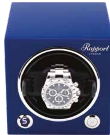
EVO42 Admiral Blue