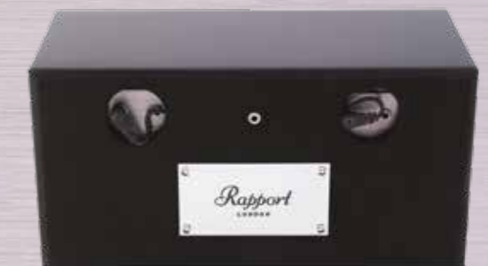
evo Double box MKIII REAR VIEW

FRO52 - Box to take Two Single Watch Winders