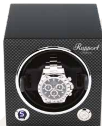
EVO50 Carbon Fibre