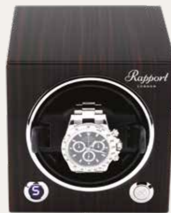
EVO51 Macassar Wood