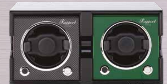
evo Double box MKIII SIZE: 140 X 280 X 150MM

FRO54 - Box to take Four Single Watch Winders