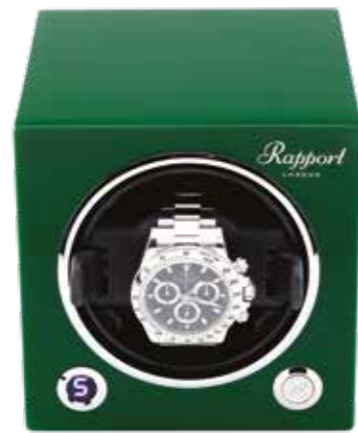
EVO44 Racing Green