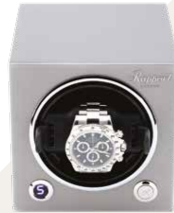
EVO45 Platinum Silver