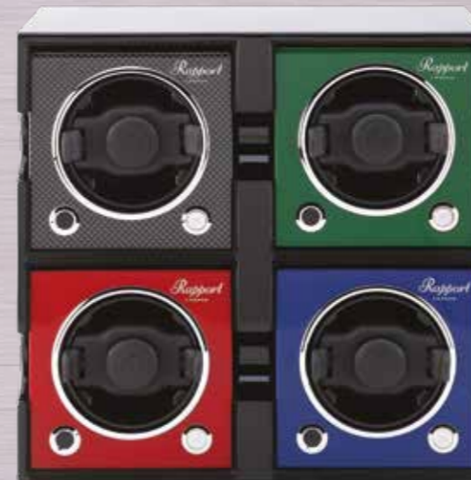
evo Quad box MKIII SIZE: 280 X 280 X 150MM

Also available are double and quad cases, constructed in gloss finish Ebony, into which you can slot individual evocube MKIII watch winders in any combination of colours you desire. Each compartment is lined with leather to allow a snug, scratch-proof fit of the units. These cases are wired to allow operation of all winders with a single electric adapter.