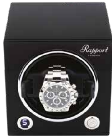
EVO40 Midnight Black

A NEW GENERATION OF ELECTRONIC WINDERS FOR PRESTIGE AUTOMATIC WATCHES SIZE: 120 X 120 X 146MM