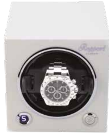
EVO41 Polar White